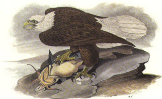
White-headed Sea Eagle, or Bald Eagle?

Everyone: "God of patience, keep me from giving up when things do not turn out as I have planned. Help me to put forth greater efforts instead of wasting my strength in useless complaint. If my own courage fails, then may I become brave through my faith in Thee. Amen."